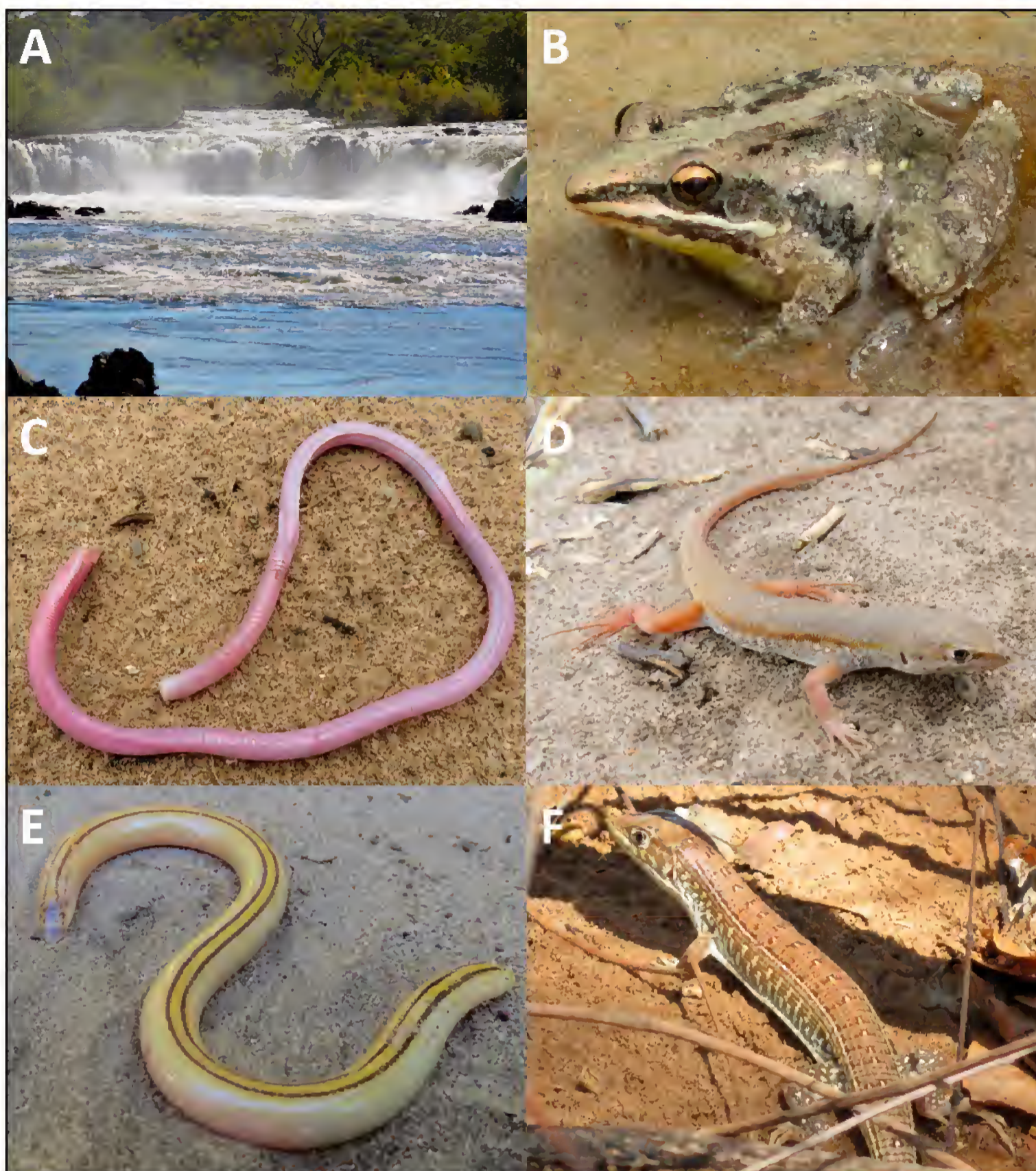
Fig. 2. Selection of amphibians and reptiles photographed in the vicinity of Ngonye Falls, south-western Zambia. (A) View of Ngonye Falls from the eastern side of the Zambezi River. (B) Mapacha Grass Frog ( Ptychadena cf. mapacha , VMUS 5990), Sioma Ngwezi National Park Headquarters. (C) Long-tailed Worm Lizard ( Dalophia longicauda ), Sioma Ngwezi National Park Headquarters. (D) Zambezi Rough-scaled Lizard ( Ichnotropis grandiceps , TM 86237), Sioma Ngwezi National Park Headquarters. (E) Barotse Blind Legless Skink ( Acontias jappi , TM 86232), Sioma Ngwezi National Park Headquarters. (F) Eastern Black-lined Plated Lizard ( Gerrhosaurus intermedius ), Sioma Ngwezi National Park Headquarters.

tip, respectively) and six one-way funnel traps placed on opposite sides of the fences in the center of each arm.